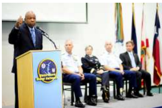
BALTIMORE - Rep. Elijah E. Cummings speaks during a Coast Guard Rescue 21 communications system acceptance ceremony

On 19 August the USCG Group Baltimore presented an acceptance ceremony for the rescue 21 project. The project employs the latest in electronic technology to locate mariners in distress on the waters of the area of group Baltimore.