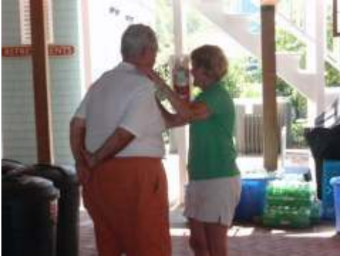
Let me fix your Tie!!