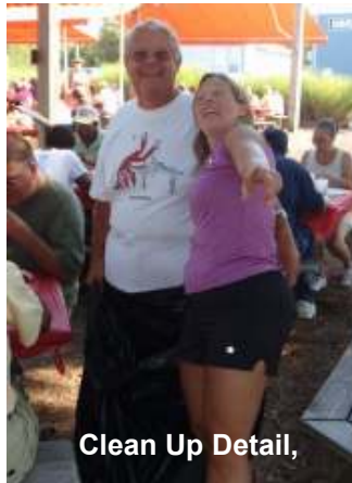
Clean Up Detail,