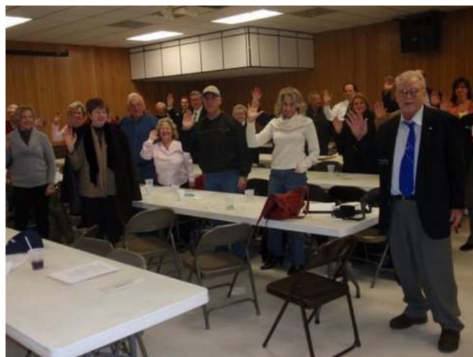
We would love to see YOU here!! Join the Fun!!!