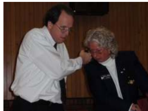
ET Call Home