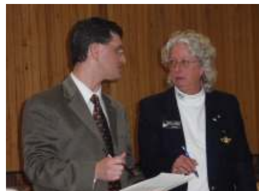
Ohhhh My ...!!