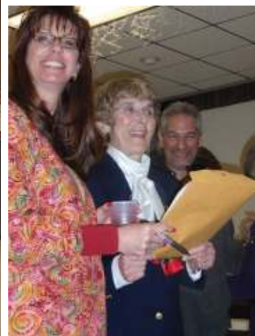
For the next verse, ...