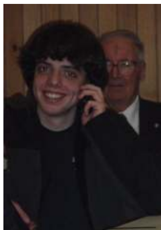
Young & Younger!