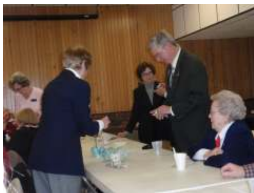
50 / 50 Raffle