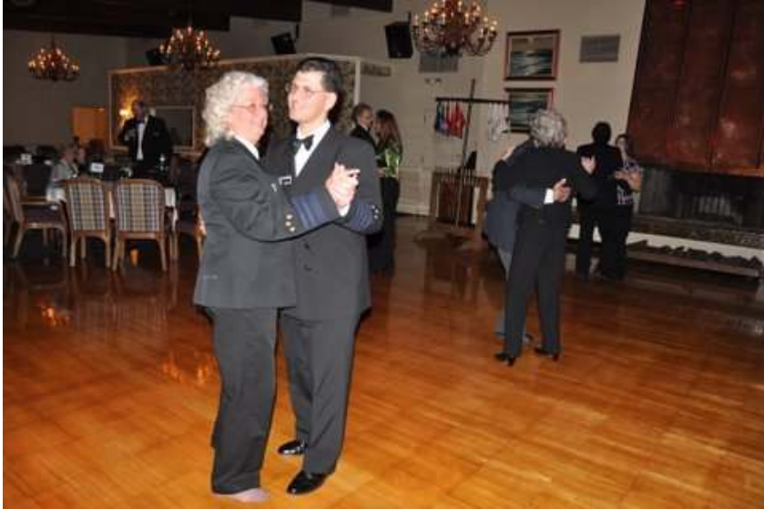
Dancing With The Stars!!

More Pictures Will Be Posted on the Website