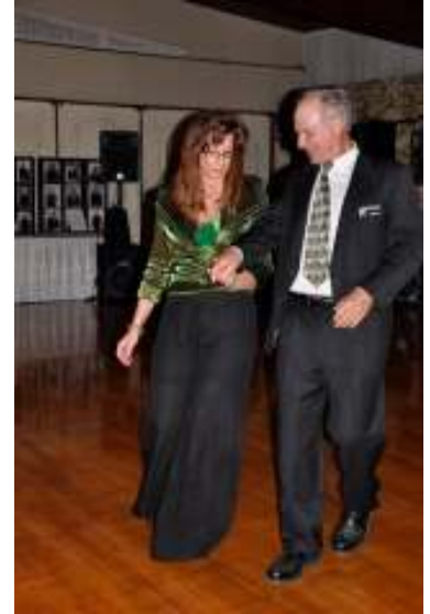
Dance Lessons 101