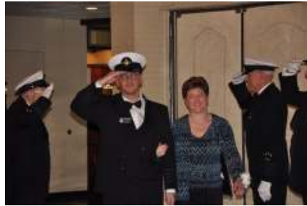
Honor Guard & Procession