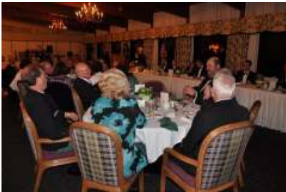
Dinner Was Delicious!!!